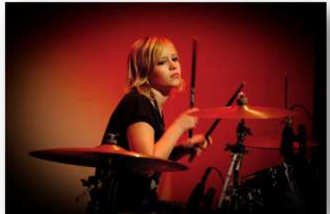
India on drums

Competition was stiff with six other bands, duos and solo performers all delivering great performances and working the audience to win support. There was an eclectic mix of rock, pop and vocals, some very well rehearsed with energetic outgoing stage performances, and others delivering beautiful melodies that touched our hearts.